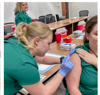
Nursing students giving and receiving a flu shot.

and more were offered, helping our community stay healthy while supporting student learning.